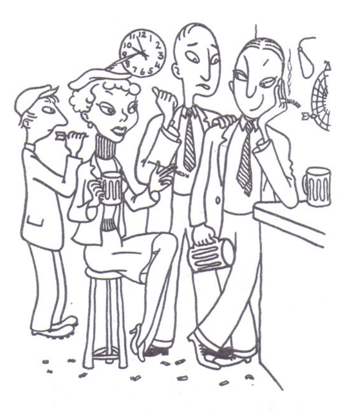
'... the mortifying spectacle of an established postgraduate student baulking the issue of a final round, in order to pay heed to the inconsequential chatter of a tap-room Circe.'

We are given detailed descriptions of the types of pub which had survived World War 2 and were little changed from the 30s; and which of the several bars in those days of multi-roomed pubs the Serious Drinker should select. Detailed advice as to what to wear, how to stand and how to hold the tankard accompany particular guidance on drinking schools and how deal with other customers in your chosen pub.