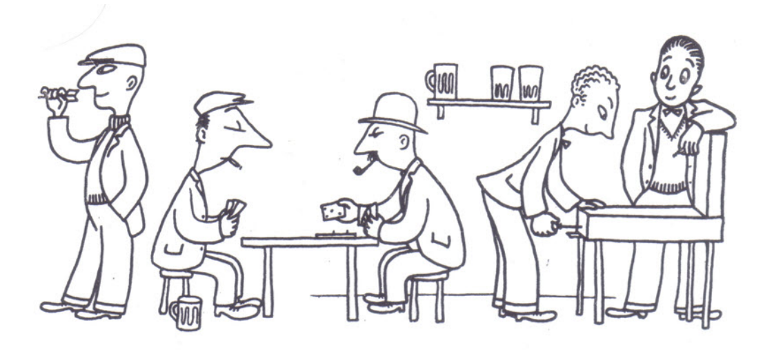
Group (V) The Crypto-serious or Miscellaneous Group. It is perfectly clear that none of these types can take his drinking at all seriously

"Drunkeness must never be the aim nor the concomitant of serious drinking". If the Serious Drinkers of the 1950s had lived 25 years later they would have been among the first to join CAMRA.