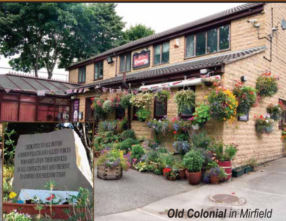
Old Colonial in Mirfield

Magazine of the Heavy Woollen branch of CAMRA